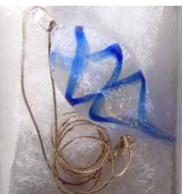
Blown Glass Pendant Raffle donated by Larry Rutland of North Creek Studio. Tickets: 1 for $1 or 8 for $5