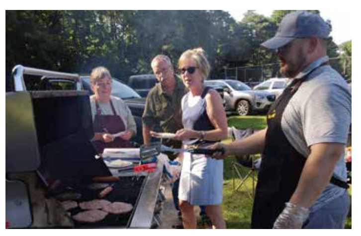
Food sold by Middle Grove United Methodist Church volunteers