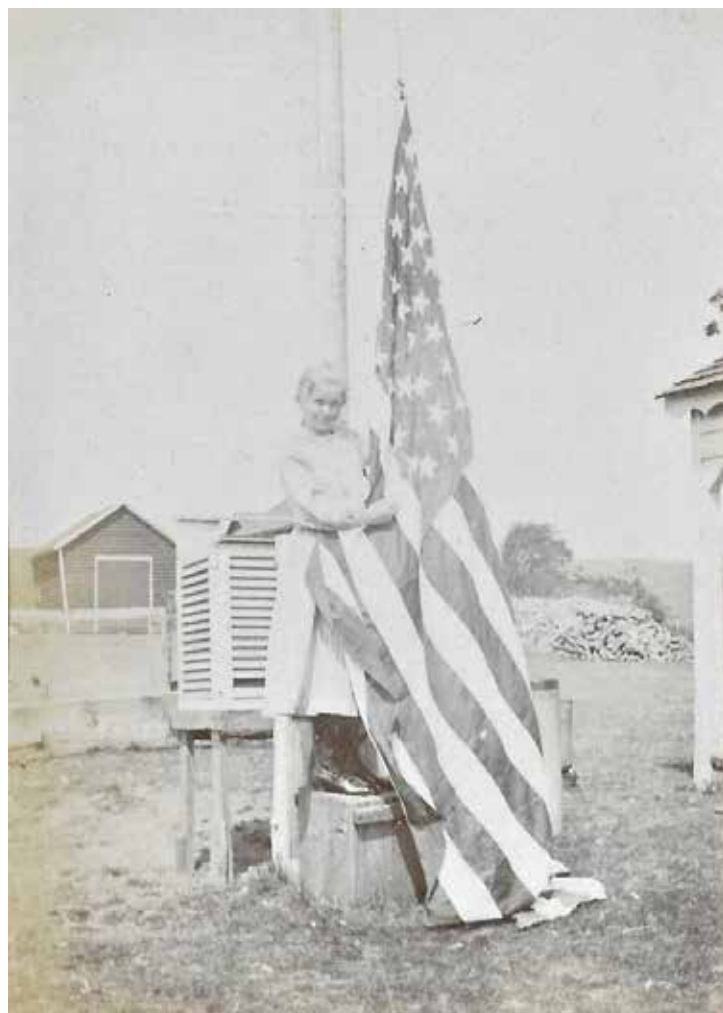
Raising the flag at the Darrow Farm