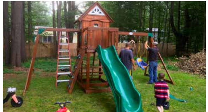
The Play Set's New Home!