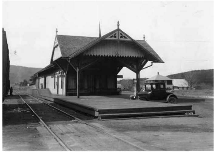
Hadley Depot Built in 1870