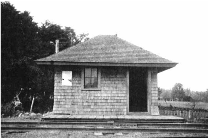
Greenfield Depot on South Greenfield Road Built in 1911