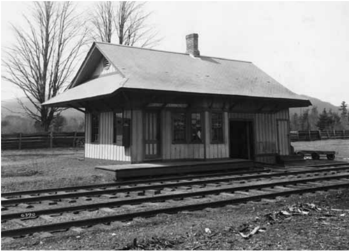
South Corinth Depot Built in 1880