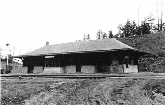
Corinth Passenger Station Built in 1910 - 1911