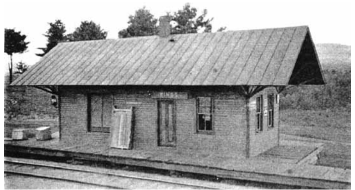
Kings Station, Greenfield Combination Passenger and Freight Station Built in 1887