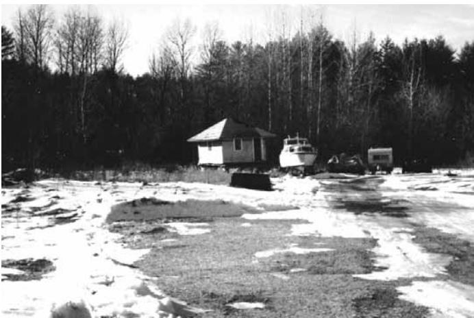
Greenfield Depot on South Greenfield Road Built in 1911 (newer photo)