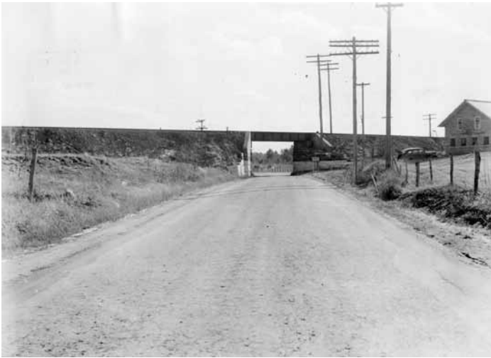
Railroad Overpass, Route 9N at Kings Station, Greenfield; Direction of picture: Southwest. Photo taken Dec. 13, 1938