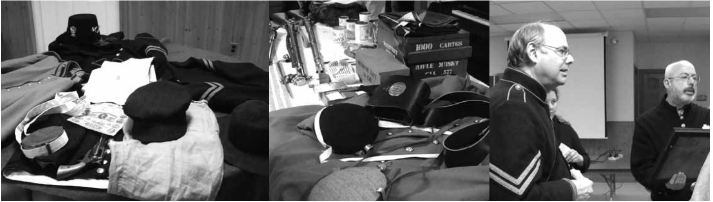
Civil War reenactment materials