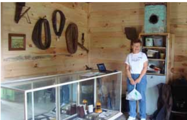
Inside King's Station, newly renovated