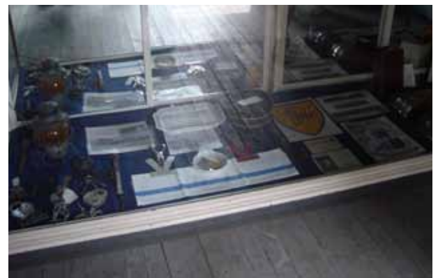
Memorabilia on display at King's Station