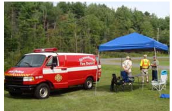
Greenfield Fire District – Parking Crew