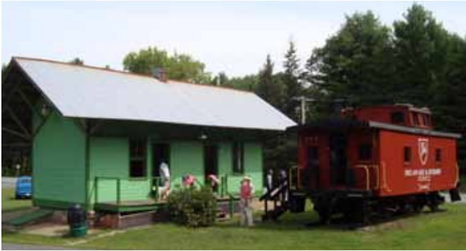
King's Station and The Caboose