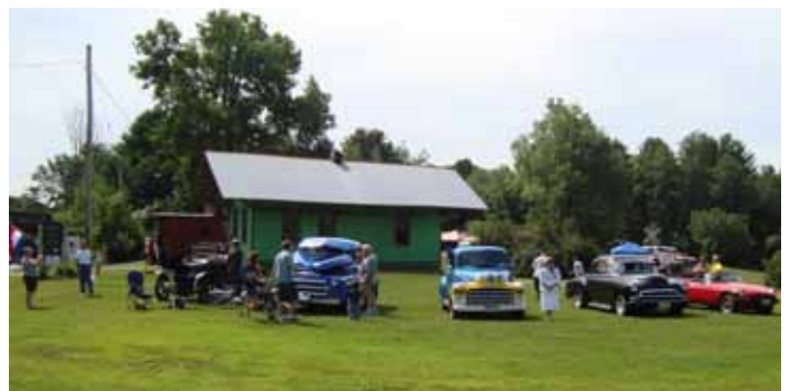
Antique Car Show