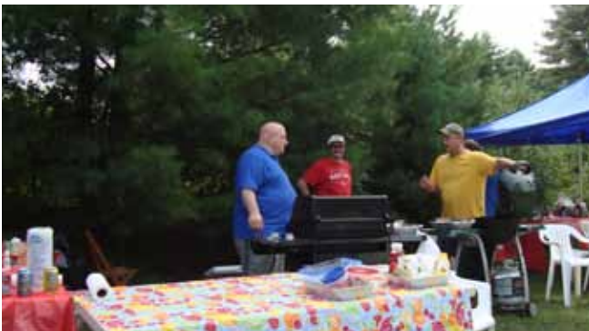
TOGHS Cooks and Organizers