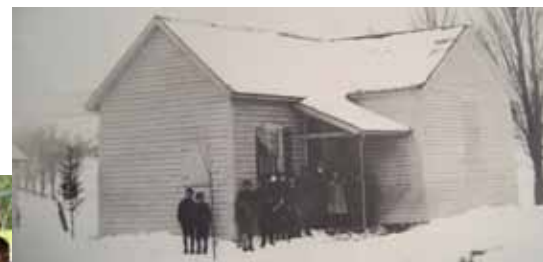
The First Porter Corners School