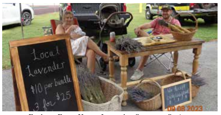
Furlong Farm House Lavender, Saratoga Springs