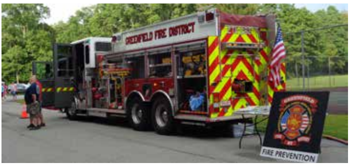
Middle Grove Fire Truck