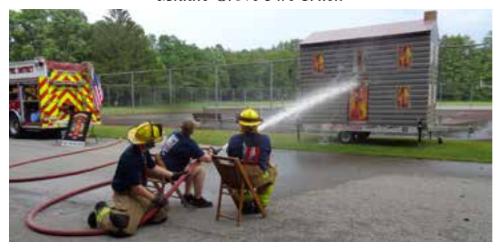
Middle Grove Fire Fighters – Hose Demonstration