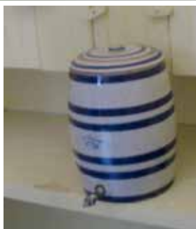
The Water Cooler