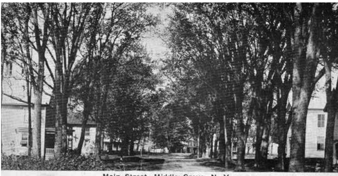
Main Street, Middle Grove, N. Y.

Near the intersection of what is now Middle Grove and Murray Roads (in 1907, they were not called that) sat a cluster of wood framed buildings tightly spaced on the north side of the intersection (where the Stewarts Shop is now located). The western most was a general store housing the post office which was owned and operated by Clifford Cady. Next to it, on the east