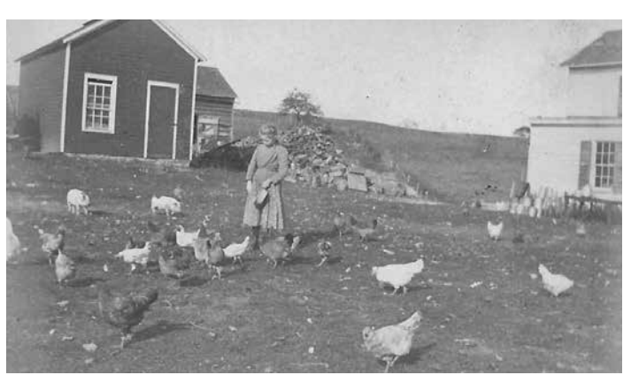
Darrow Farm 1902 feeding chickens