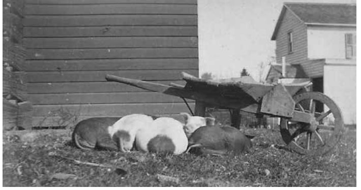
Darrow Farm 1902 pigs