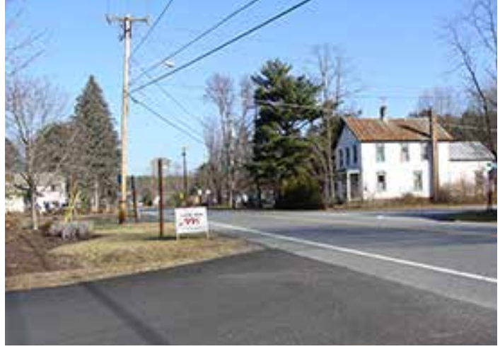
Moses D. Rowell's house taken from Stewart's driveway looking east. Murray Road on the right.

You may remember from earlier articles that Moses D. Rowell, owned the eastern most of the two stores. On October 14, 1880 an article in the Saratoga Sentinel under Middle Grove news states that, "Moses D. Rowell is building a new house on the corner opposite the store." This is the same two story wood frame house that still stands on the southeast corner of the intersection of Middle Grove and Murray Roads, diagonally across from the Stewart's Shop. This new Rowell home was adjacent to the first park or grove area lot that was lumbered off and would be later used as a pasture for Rowell's cows. (Much later under the ownership of Richard R. and Laura Roeckle, the cow pasture became a mobile home park that still exists today under the ownership of Charlie Pita.