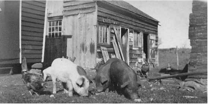
Darrow Farm 1902 pigs with chickens