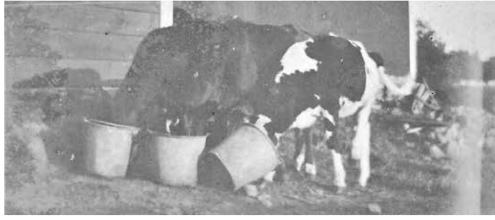
Darrow Farm cows eating