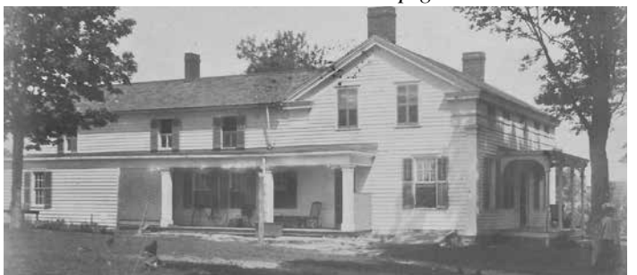
Stephen Elliot Darrow home, Locust Grove Road