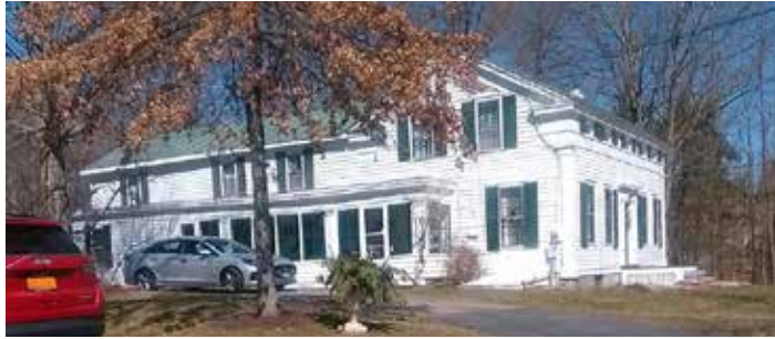
290 Locust Grove Road, April 2021