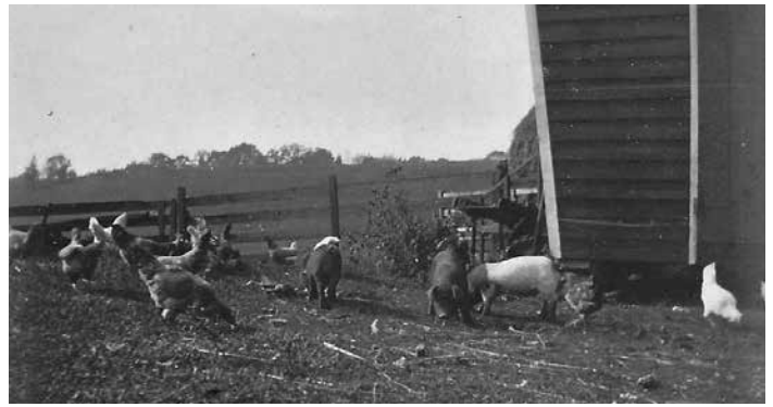
Darrow Farm 1902 pigs and chickens