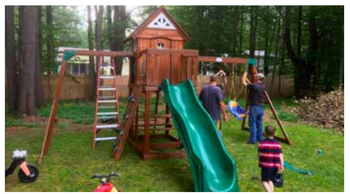
The Play Set's New Home!