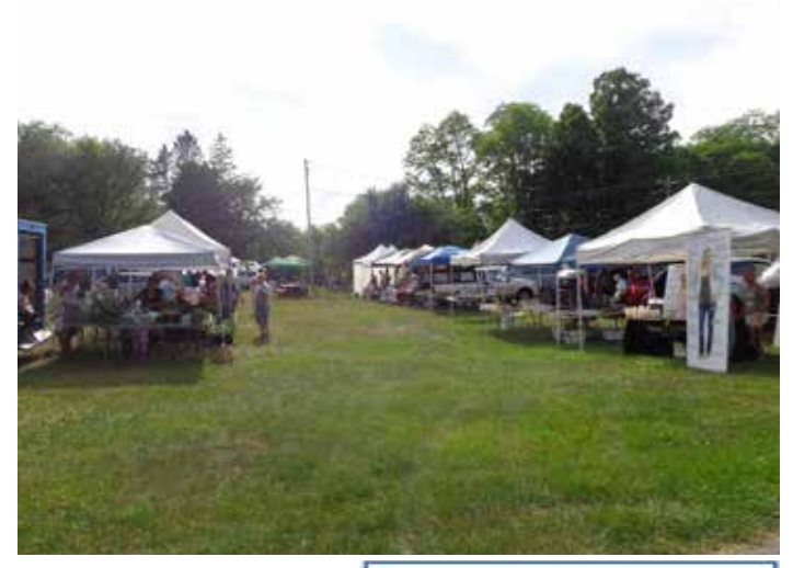
Sponsored by The Town of Greenfield Historical Society Supported by the Town of Greenfield

To become a vendor or for more information, please contact the market committee by email at manager@greenfieldfarmersmarket.org