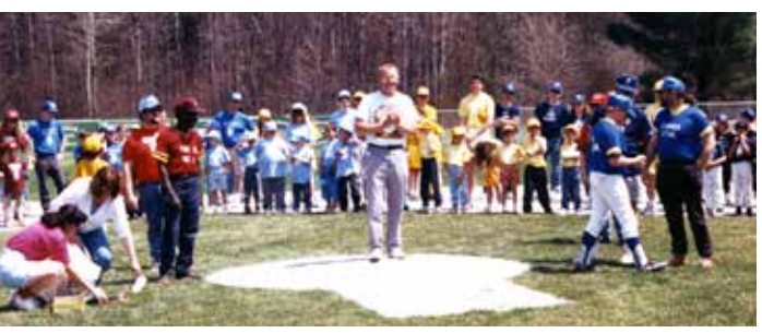
Don about to throw out the first ball of the season on opening day, May 1, 1993.