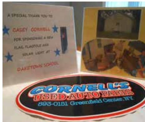
Casey Cornell is donating a flag, pole & solar light for the Daketown School.