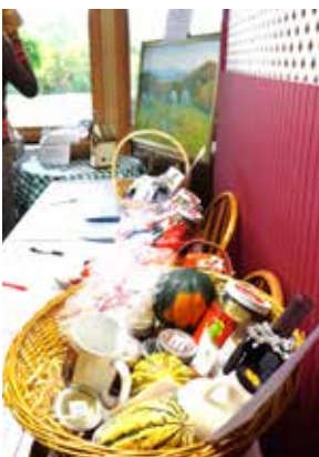
Silent Auction Items