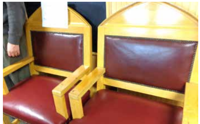
The Odd Fellow's Chairs for the Silent Auction