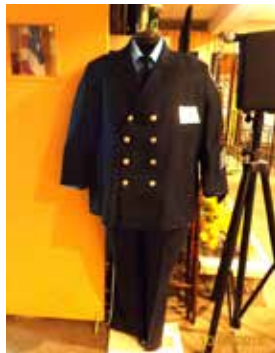
Town of Greenfield Fire Department Uniform