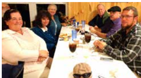
The Woodard/Capasso/Hozier Family