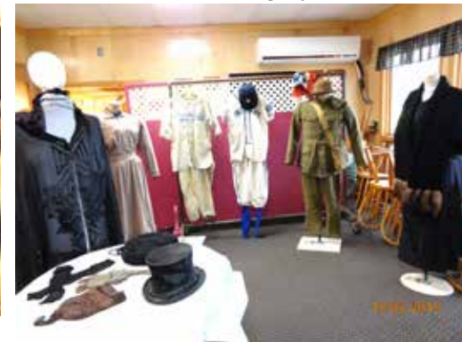
Clothing Display from the Chatfield Museum of Local History