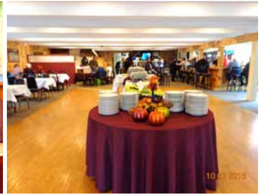
The Haven Tee Room