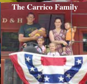
The Carrico Family