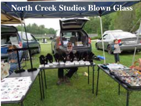
North Creek Studios Blown Glass