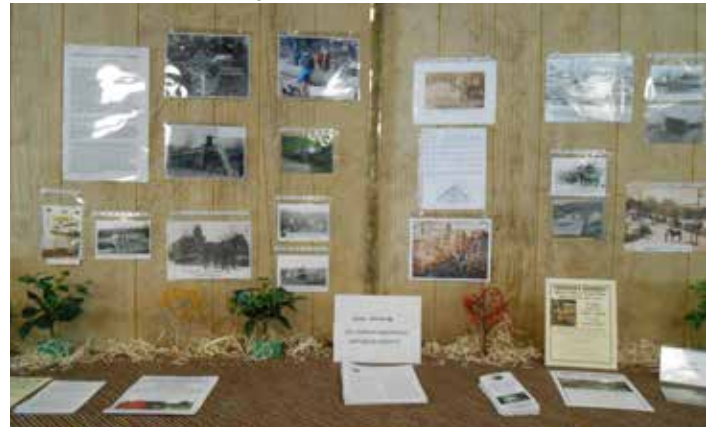
The Town of Greenfield Historical Society's display on Lumbering in the Town of Greenfield.