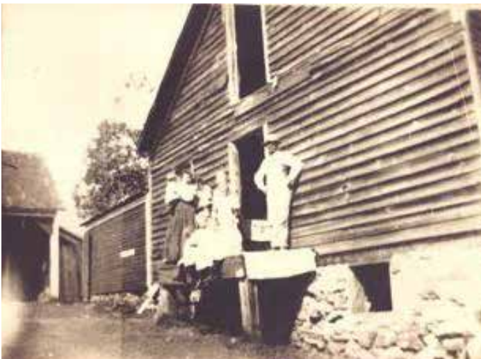
The Jones Family at the same mill on Allen Road around 1911.