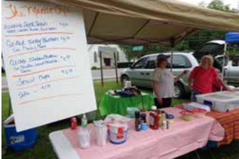
The Market Cafe & Historical Society