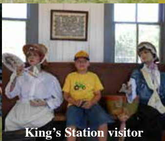
King's Station visitor