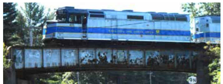
The Saratoga and North Creek Train crossing the overpass on 9N by the Caboose and King's Station.