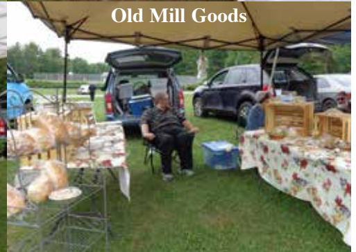
Old Mill Goods