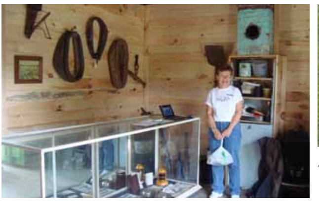
Inside King's Station, newly renovated