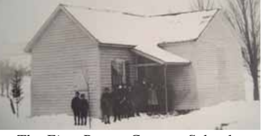
The First Porter Corners School