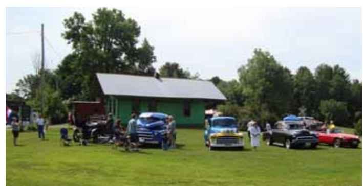
Antique Car Show