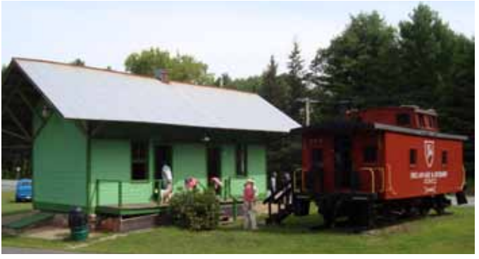
King's Station and The Caboose