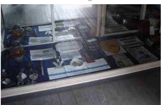
Memorabilia on display at King's Station