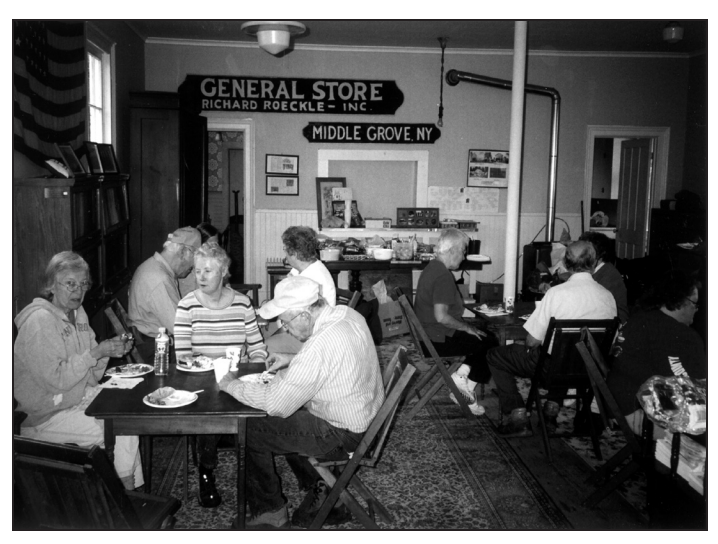
Some workers at the IOOF Hall enjoying their lunch.

Christmas tree, which had come apart when we moved it. They ended up on the floor trying to fit all the pieces together again while I tended the fire outside. It had burned itself down to a large pile of red-hot embers, and I was wondering how I was going to find enough water to put it out. I knew that without water, it would probably stay hot all night, and I didn't want to stay with it. That's when it started to pour rain (just like the forecast had said). I just raked the coals out in a thin layer and listened to them fizzle as the rain came down. Within a half-hour, they were cool enough to leave, and by that time the Christmas tree was together again, so we all said our tired good-byes, and with a real sense of satisfaction for a job well done, we left too.