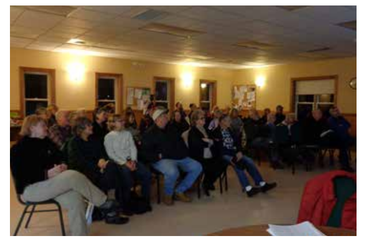
38 people attended the program