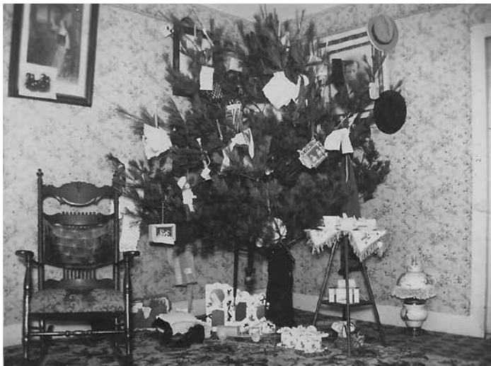
Christmas at the Darrow house on Locust Grove Road, 1890s or 1900s.

We always cut a tree on land owned by one or the other of my grandparents. One year we cut a scotch pine tree, from the land I currently live on, and had it fully decorated in the living room. My father realized that it was starting to lean and should be wired to the wall, but he was not going to put a hole in the living room wall or ceiling to attach a wire. So he ‘dragged’ the fully decorated tree, in an upright position, through the house to the family room addition where he proceeded to jam the tree in a corner. Ornaments had fallen off the tree on the way and as he pushed the tree into the corner, the tree topper (hand blown glass spire from family in Germany) snapped off. Not being deterred, he wired the tree to the corner so it would not fall over. I still have that spire, which has been rigged to hang upside down as an ornament.