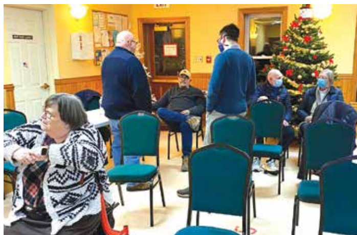
Some of the participants at the November meeting/program