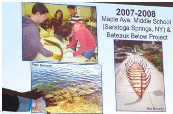
Maple Avenue Middle School students helping with the Bateaux Project in 2007–2008