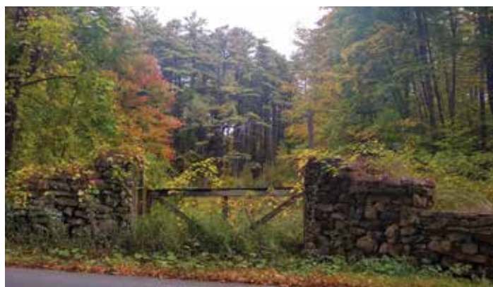
October 3, 2020